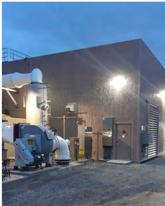
Newly Constructed Agua Hedionda Pump Station

Cost Allocation – The AHPS is operated by EWA under a contract with the owner agencies. The costs of operating and maintaining the AHPS are allocated to the City of Vista (69.1%) and the City of Carlsbad (30.9%) in accordance with the May 2017 Memorandum of Understanding.