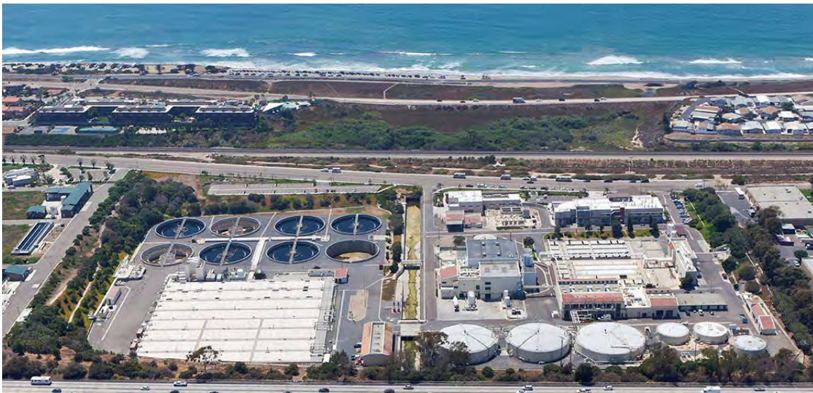
Encina Water Pollution Control Facility

Cost Allocation – The EWPCF costs are allocated among member agencies based on ownership and usage charges in accordance with the Financial Plan and Revenue Program. EOO costs are allocated among Member Agencies based on the volume of effluent discharged. JFMS costs are allocated among the Member Agencies based on the number, location and type of meters.