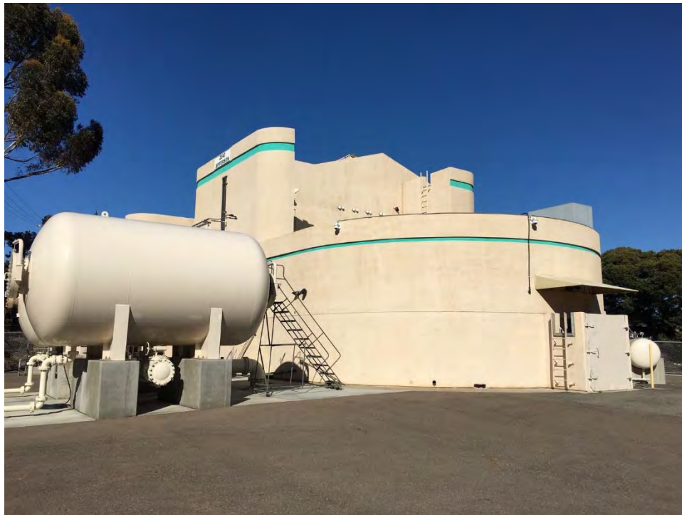
Buena Vista Pump Station

Cost Allocation – The BVPS is operated by EWA under a contract with the owner agencies. The costs of operating and maintaining the BVPS are allocated to the City of Vista (89.6%) and the City of Carlsbad (10.4%) in accordance with the May 2017 Memorandum of Understanding.