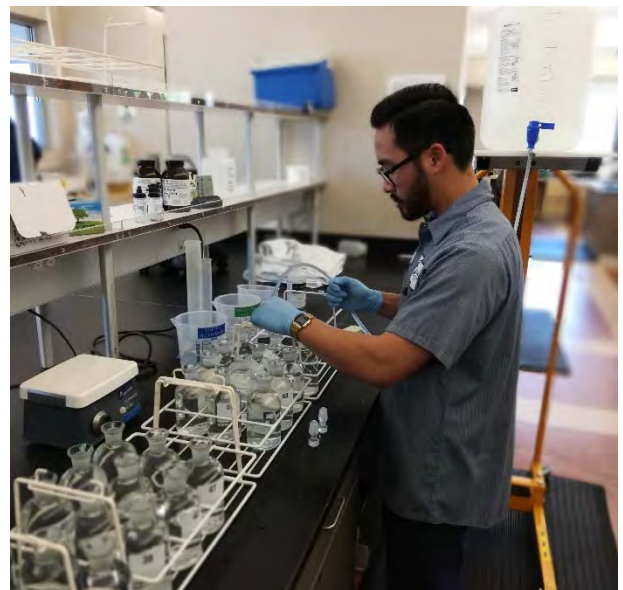
Testing biochemical oxygen demand levels

EWA's Laboratory, which is certified by the State of California's Environmental Laboratory Accreditation Program, analyzes over 32,000 samples per year including process control, plant influent and effluent, biosolids, industrial user samples, ocean water, storm water, and drinking water. A portion of the analyses is completed under contract for EWA's Member Agencies, which generated $215,347 in revenue in FY2018, offsetting operating expenses.