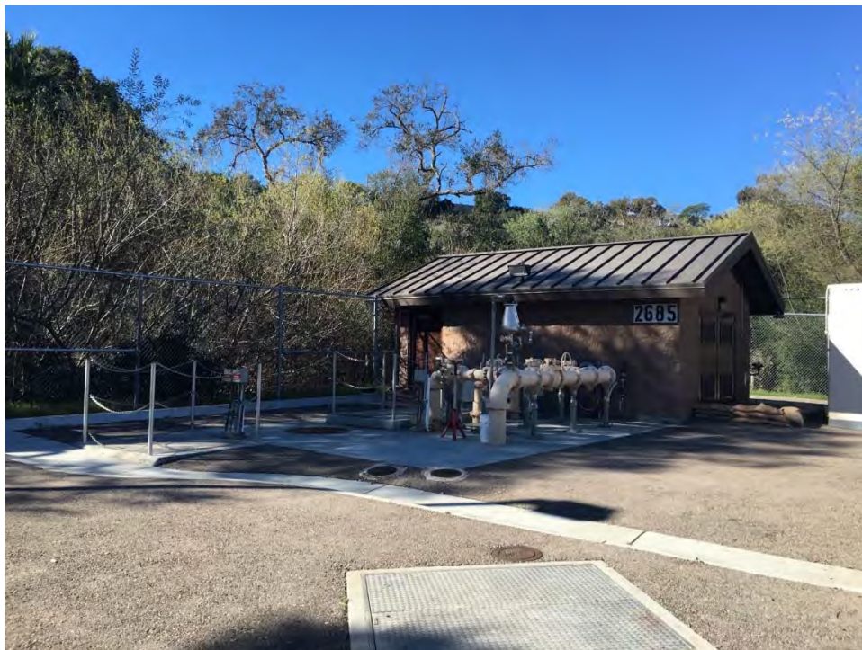
Raceway Basin Pump Station

Cost Allocation – The RBPS is operated by EWA under a contract with the City of Vista. 100% of the costs for operating and maintaining the RBPS are allocated to the City of Vista in accordance with the May 2017 Memorandum of Understanding.