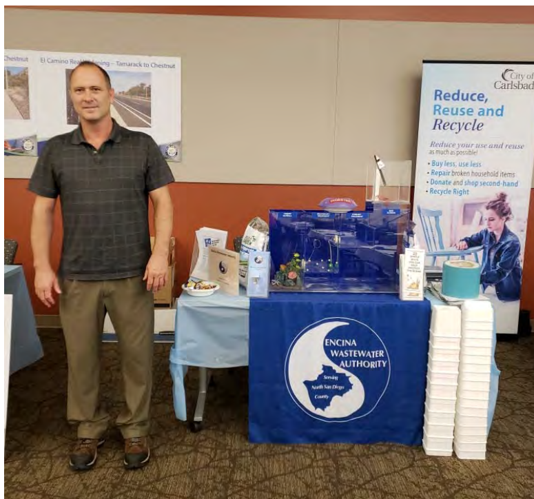
Public Outreach at the City of Carlsbad Citizens Academy

Cost Allocation – Personnel Expenses make up over 88% of Source Control's budgeted expenses. Over 86% of personnel expenses are allocated to Member Agencies based on the actual level of effort by staff. Remaining personnel expenses and all non-personnel expenses are allocated to the Member Agencies on the basis of Encina Ocean Outfall flows.