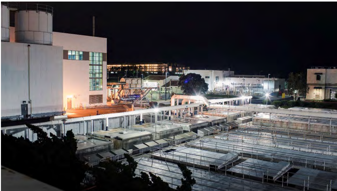
Primary Treatment Area

EWPCF – Capital Improvements – Capital Improvement Projects are those projects that increase or maintain the capacity of the Joint System and require a significant time commitment from staff. These projects regularly span multiple fiscal years and, therefore, unspent appropriations are typically carried forward by the Authority's annual Appropriations Resolution. Capital Project costs are allocated to Member Agencies based on ownership of the affected facilities. All Capital Projects are studied, designed, and executed pursuant to EWA's Comprehensive Asset Management Plan.