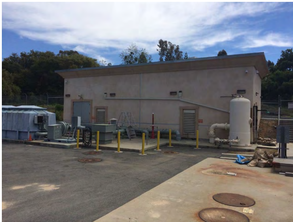
Buena Creek Pump Station

Cost Allocation – The BCPS is operated by EWA under a contract with the BSD. 100% of the costs for operating and maintaining the BCPS are allocated to the BSD in accordance with the May 2017 Memorandum of Understanding.