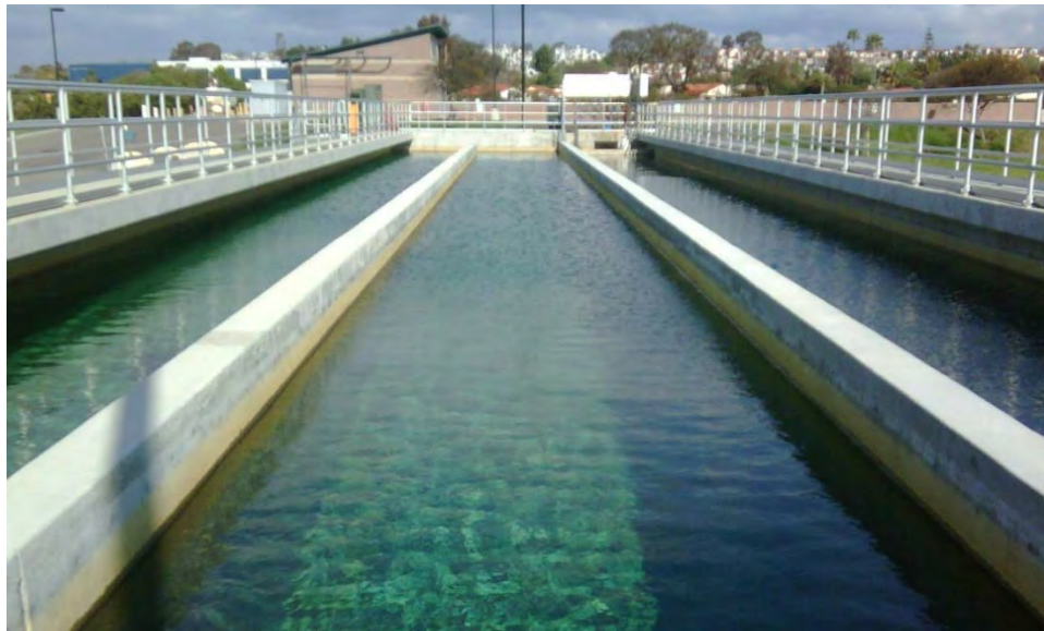
Carlsbad Water Recycling Facility

Cost Allocation – The CWRF is operated by EWA under a contract with the City of Carlsbad. 100% of the costs for operating and maintaining the CWRF are paid by the City of Carlsbad in accordance with the May 2005 Memorandum of Understanding. Recommended expenses are based on the expected recycled water production volume. Actual expenditures will reflect the actual volume of recycled water production.